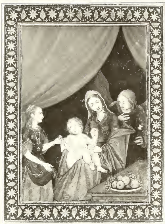
Figure 23. Madanna and Child , school of Abu'l-Hasan (1584–ca. 1628) after Aegidius Sadeler (Flemish, 1570–1629). India, Mughal period, Salim studio, Akbar period, ca. 1599–1605. Album page; opaque watercolor and gold on paper, 24 x 19.1. Cincinnati Art Museum, Fanny Bryce Lehmer Endowment, 1985.14